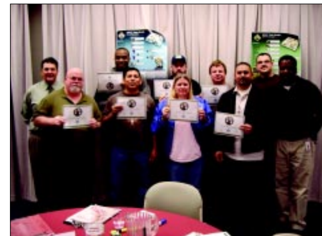
The Mt. SAC (OS1) Pilot Team at Boot Camp graduation.