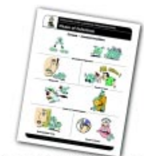
Chain of Infection (OS1) Training Chart from the (OS1) Certified Coach class 2008.

I had just returned from (OS1) Certified Coach and so I was fortunate to have some new teaching materials that I wanted to try. I taught our normal disinfectant process and used the Chain of Infection training tool that we received at Certified Coach to illustrate how cross-contamination occurs.